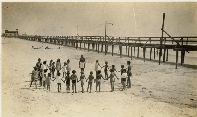
Beach class 1935