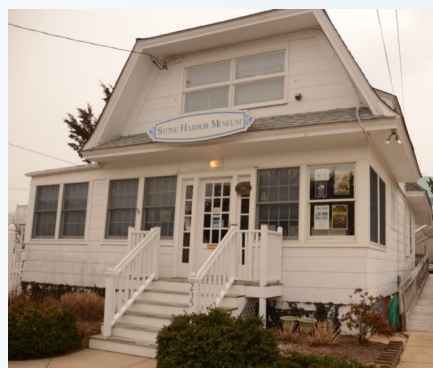
Original Stone Harbor Museum