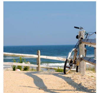
Cape May County Board of Chosen Freeholders, Dept of Tourism, Public Information and Culture & Heritage