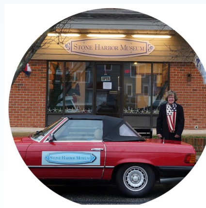
Current Stone Harbor Museum

Funding has been provided in part by the New Jersey Historical Commission//Dept of State, the New Jersey State Council on the Arts, Dept. of State, the National Endowment for the Arts, and the Cape May County Board of Chosen Freeholders through the Cape May County Dept of Tourism, Public Information and Culture & Heritage.