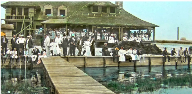
Stone Harbor Yacht Club—under construction

The Museum is about to begin the conversion of all of their pictures, documents, books, etc. into digital images that can be viewed on our Web Page.